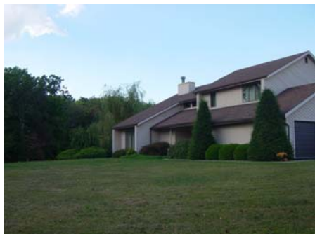
Gaspar - Before

The photos above are of a paver patio design project for Sarah and Dan Leddy of Bethlehem. The Leddy's wanted a large enough area to be able to entertain comfortably. Joe designed the shape of the patio, keeping in mind there had to be an area for grilling, areas for tables and patio furniture and areas for seating. The patio is constructed of EP Henry Coventry I with a color mix of 2/3 Autumn Blend and 1/3 Pewter Blend. The pavers were laid in an "I" pattern but the colors were put in randomly. The seating walls are built out of EP Henry Coventry Wall Stone in Autumn Blend with Pewter Blend caps. The contrast in color turned out quite stunning. Also installed during the construction of the patio is low voltage wall and step lighting. Please see Page 4 for an excerpt from Sarah and Dan's Testimonial Letter.