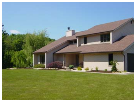
Gaspar - After