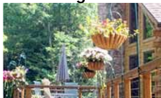
Water Hanging Baskets with Drip Irrigation!